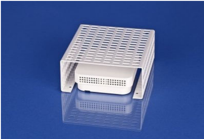
Photo show sensor guard SGD MS1 together with VCP room humidity/temp. transmitter RHT 010 010